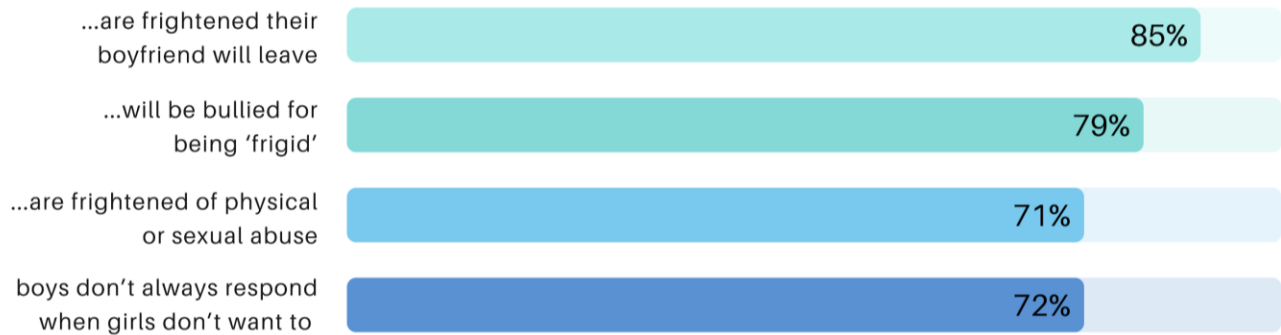
Figure 1: 'Coercion and control'. Data from the Girls' Attitudes Survey (Girlguiding, 2015)